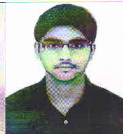
Test Day Photo